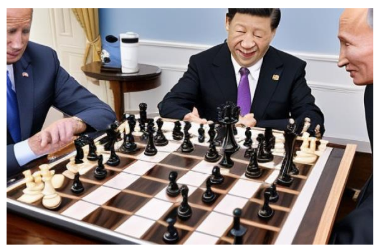
Will 2023 be the year of great convergence?